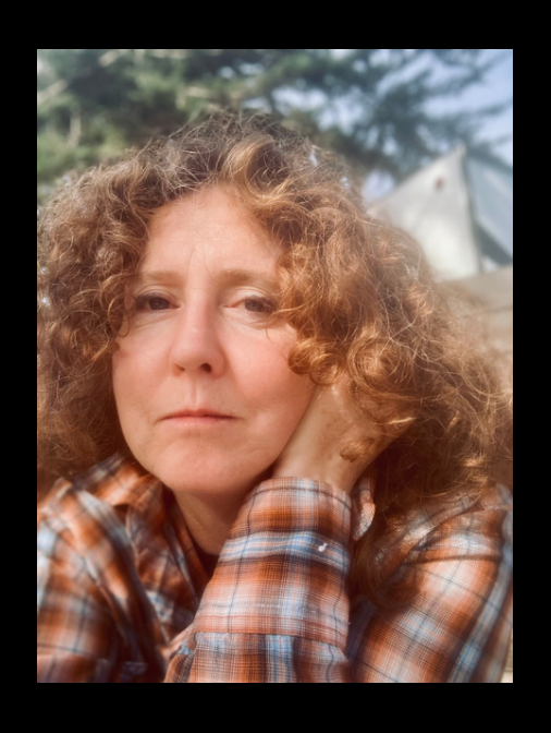
Play by Elizabeth Flanagan