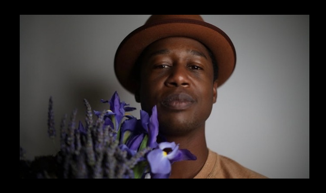
Play by Troy Rockett