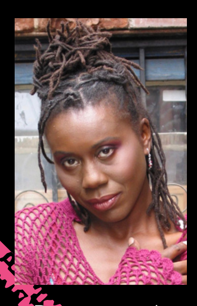
Dramaturgy by Remi Majekodunmi