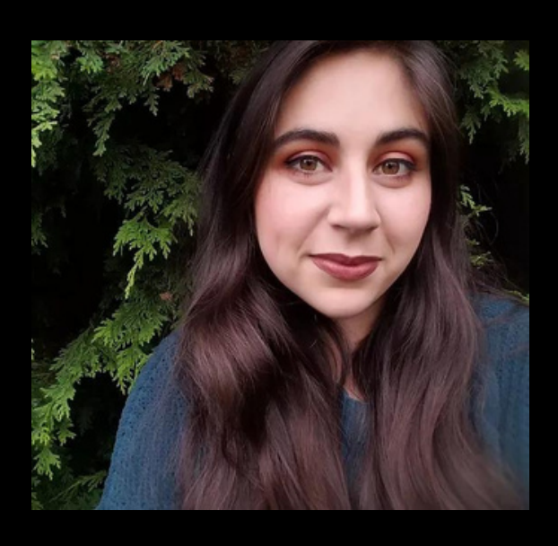
Play by Eteya Trinidad